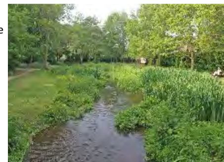
Meades Water Gardens